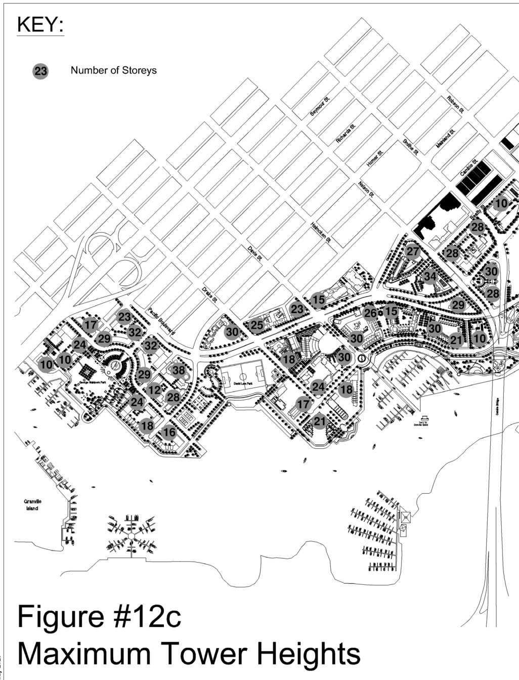
Figure 12c L