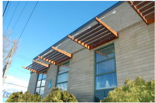
Examples of external sunshades